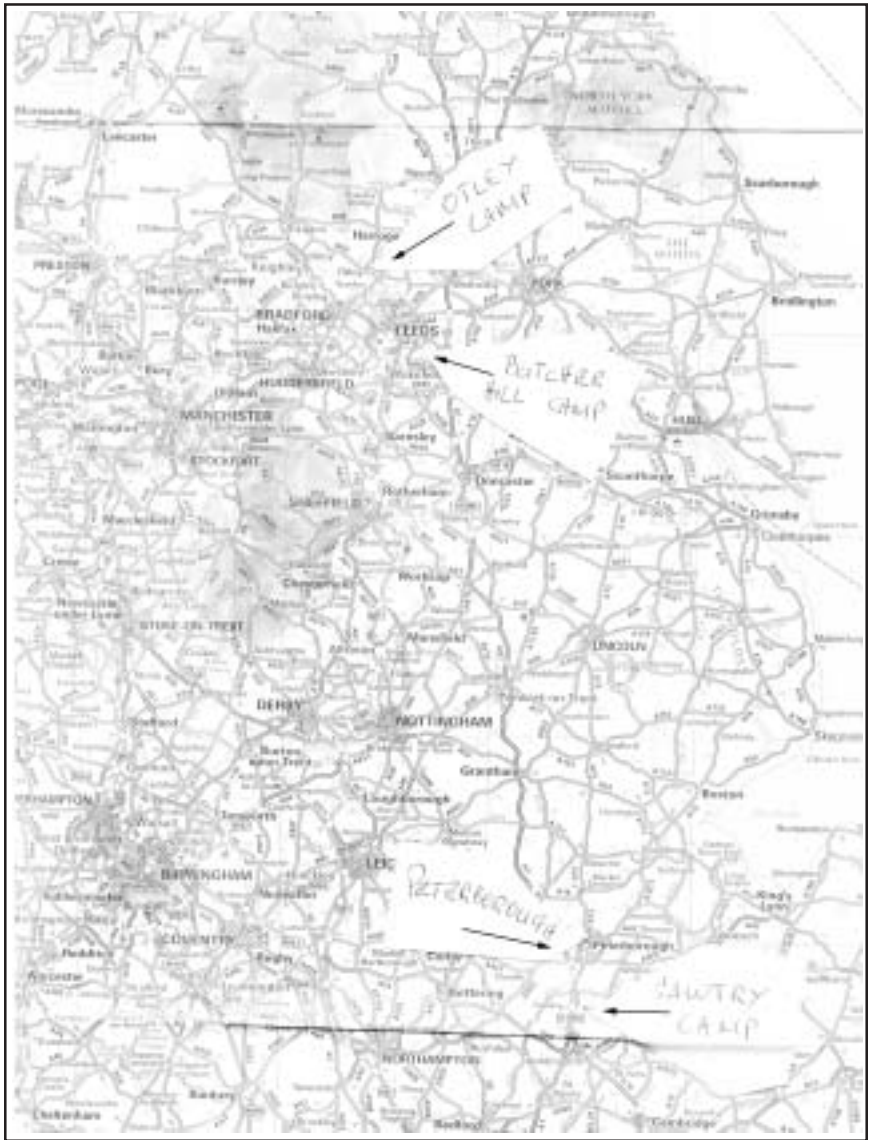
The location of the POW camps in England